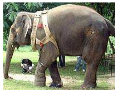
Thai elephant walks with prosthesis

For the Germans, knowing the impact of the World Cup goes far beyond football is a lesson they have understood since