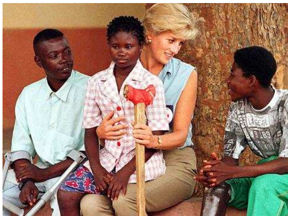
Diana visits landmine victims in Angola, early 1997

Over 80,000 people have received assistance from the ICRC's work, which also includes a microcredit scheme to help landmine victims re-establish themselves in society. The ball