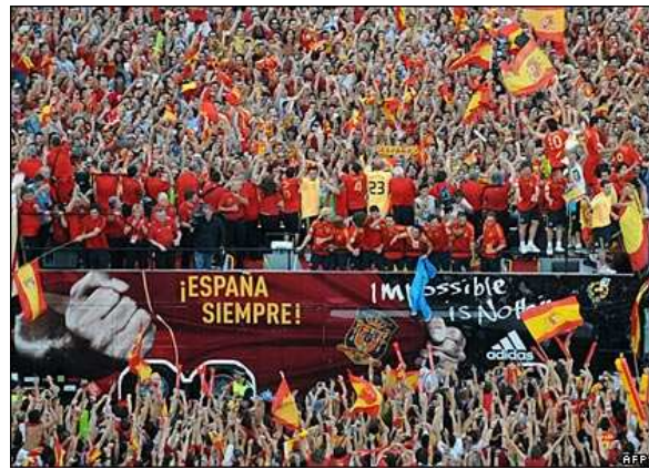
Over one million Spaniards pack the streets as the Champions head towards the Plaza de Colon in the open top bus

Even the normally downbeat Aragones was caught up in the moment and joined the singing of "A Por Ellos" ("Let's Go Get Them"), in a reference to the team's theme songs since the 2006 World Cup.