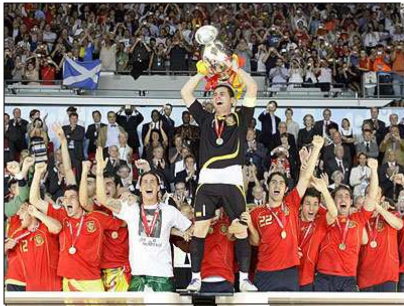
Casillas lifted the Henri Delaunay Trophy for Spain

defender Philipp Lahm and Torres shrugged him off the ball to lift a superb finish beyond Lehmann.