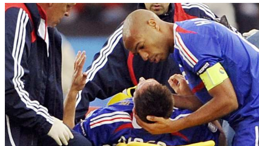
Franck Ribéry is comforted by Thierry Henry

Franck Ribéry, the winger who had been France's brightest spark at this tournament barged into tackle Gianluca Zambrotta and injured himself in the ensuing tangle of legs. It was almost as if he had been trying too hard, but that is the kind of infectious character the 25-year-old Ribéry seems to be. His Bayern team-mate Toni, however, was back on the big screens when he won the penalty from which Andrea Pirlo put Italy in front. Stretching out a leg to bring under control a long Pirlo pass, he went down under the challenge of the hapless Abidal, who duly saw red. Toni himself