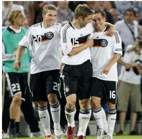
Lukas Podolski, Thomas Hitzlsberger, Phillip Lahm