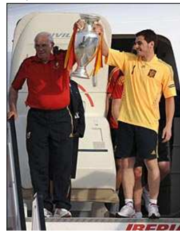
The Henri Delaunay Trophy is carried off the Plane by Coach Luis Aragonés and Captain Iker Casillas

defender Philipp Lahm and Torres shrugged him off the ball to lift a superb finish beyond Lehmann.