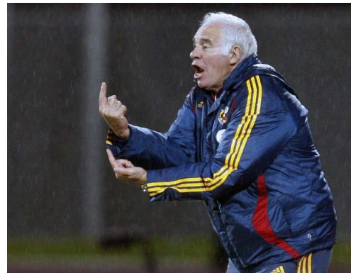
Luis Aragonés, Spain's National Trainer

Xavi's pass created uncertainty for Germany