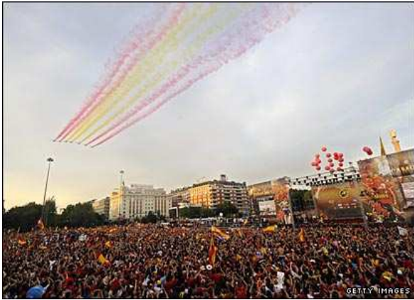
The Spanish Air Force salutes the Team as they make a multi-coloured high-speed pass over the Plaza de Colon

The Madrid keeper then handed the microphone to the "one man who got us where we are today, Luis Aragones".