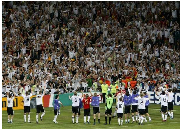
German players greet the fans as they celebrate their Victory

Germany went into their quarter-final against Portugal in Basel as many people's underdogs. Following their 3-2 win, left-back Arne Friedrich knew they would be clear favourites when they return to St. Jakob-Park to face Turkey.