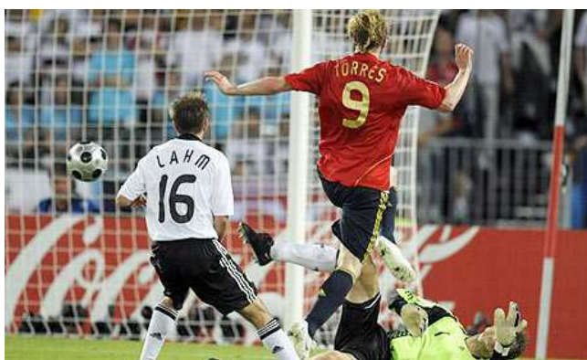
Fernando Torres lifts the ball over Lehmann to score winning goal

With a deserved 1-0 win over Germany in the final of the European Championship, Spain regained the Euro glory it has captured in 1964 by defeating the Soviet Union. This victory rounded off a fantastic overall performance of the Spanish team throughout the tournament.