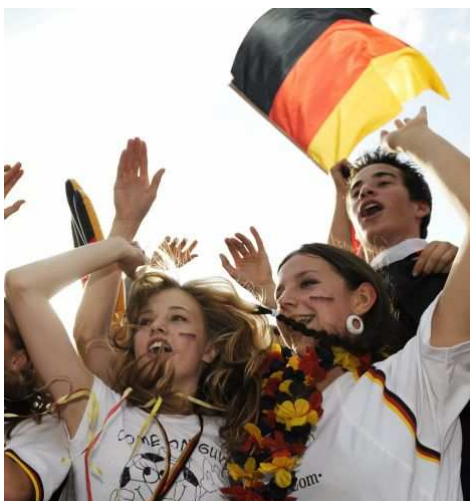
German Fans before the Semi

But Turkey, under the inspirational leadership of coach Fatih Terim, were continuing to