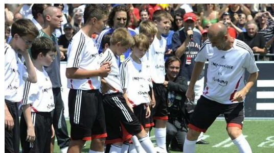
Zinedine Zidane with youngsters at the Fan Zone