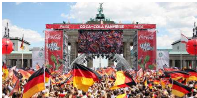
Heroes' Welcome for Germany's almost Champions

"I don't think we'd have gone so far without these great fans," said Captain Michael Ballack.