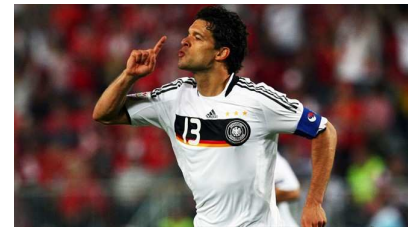
Scolari praised Michael Ballack

Luiz Felipe Scolari, the Brazilian Coach of the Portuguese, pulled out a piece of paper from his pocket and started reading to the packed room of journalists: "No. 17 Germany: 1m98, No. 13: 1m88, Klose: 1m82, No. 21: 195. I have to worry about that – and that my players are 115 cm, 120 cm." It was a moment of comedy yet it illustrated one of the Portugal's principal concerns about their UEFA EURO 2008 quarter-final opponents Germany.