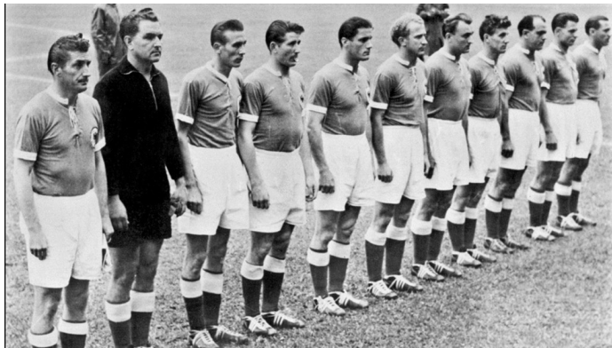
Fritz Walter (left) with his team prior to the 1954 FIFA World Cup

But this was always a minority view and as the fuss died down about excessive celebrations, the benefits to West Germany of the victory became clear. Some modern day historians call the football triumph a founding event in the birth of the West German state.