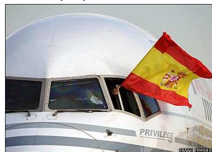
The Champions fly back into Madrid after winning the first major tournament for 44 years

Germany's problems threatened to worsen when Ballack needed lengthy treatment for an eye wound after a clash of heads with Marcos Senna.