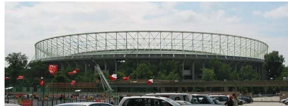
Ernst-Happel-Stadion, Vienna, built in 1929-1931, Renovated 1986

Four cities, Vienna, Salzburg, Innsbruck and Klagenfurt, hosted the matches in Austria and the cities of Bern, Basel, Geneva and Zürich hosted the events in Switzerland. Each venue has a capacity of at least 30,000 for the tournament; the largest Ernst Happel Stadion in Vienna has a capacity of 53,295. For this reason Ernst Happel Stadion hosted the final. Switzerland played all of its group stage matches at St. Jakob Park in Basel, which also hosted the opening match of the tournament as a compromise for the final being held in Vienna. Austria played all of its group stage matches at Ernst Happel Stadion.