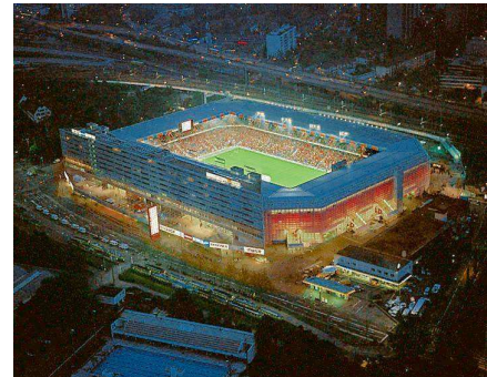
St. Jakob-Park, Basel

The draw for the final tournament took place on 2 December 2007 at the Culture and Convention Centre in Lucerne, Switzerland. In a return to the format used at Euro 92 and Euro 96 the games in each group was held at just two stadia, with the seeded team remaining in the same city for all three matches. As was the case at the 2000 and 2004 finals, the finalists were divided into four seeding pots, based on average points per game in the qualifying phases of the 2006 FIFA World Cup and Euro 2008, with each group having one team from each pot. Switzerland and Austria, as co-hosts, and Greece, as defending champions, were seeded first automatically. The Netherlands were seeded based on their UEFA coefficient in the Euro 2008 finalists ranking.