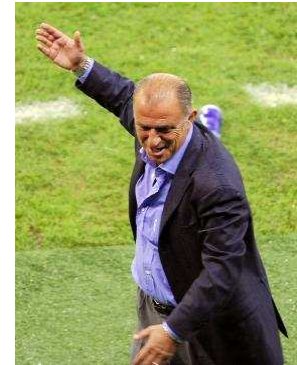
Turkey's Fatih Terim

Three-time FIFA World Player of the Year Zinedine Zidane gave 20 children a day to remember on Sunday when he joined in a small-sided game at one of Vienna's UEFA EURO 2008 Fan Zones. Zidane, who turned 36, was at the Adidas Football Park on the Heldenplatz in the centre of the Austrian capital, where youngsters got the chance to train as well as play alongside the former World and European Champion. "Working with children is the most important thing for me," said Zidane, who was part of the France team that won UEFA EURO 2000. "When children can play with their idols, they can learn a lot. If I had had that opportunity as a child, it would have brought me a lot."