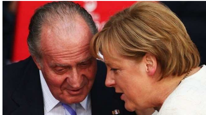
King Juan Carlos with German Chancellor Angela Merkel

Leading figures from royalty, politics, culture and sport were present at the final Germany vs. Spain, emphasising the huge global charm of the game. Heading the list of VIPs at the Ernst-Happel-Stadion were Spain's King Juan Carlos with Queen Sofia and Prime Minister José Luis Zapatero, together with their German Counterparts, President Horst Köhler and Chancellor Angela Merkel. The celebrity count also included Austrian President Heinz Fischer, Chancellor Alfred Gusenbauer and Swiss Federal Councillor Samuel Schmid as well as Henry Kissinger, Hollywood celebrity Harrison Ford and Formula one World Champion Michael Schumacher.