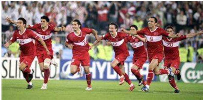
Turkish Players celebrate their shoot-out win

That did not mean that the Turkish team would lack support, particularly among the estimated two million people with Turkish roots in Germany. "I telephoned my girlfriend in Berlin and she said the celebrations of the Turkish fans in the streets on Friday night were unbelievable," said a German player. "On Wednesday there will be a very special festival of football in Germany and hopefully, at the end, our fans will have something to celebrate."