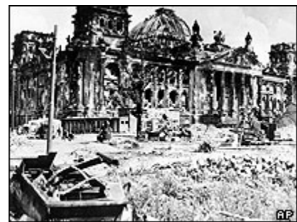
Victory had a Great Psychological impact In Post-War Germany

The shoe manufacturer "Adi" Dassler had been a key member of the team's backroom staff: his invention of the "removable stud" playing a largely unheralded role in the final victory. Within days of the victory in Berne, Dassler's company, Adidas, was advertising "the boot which won the World Cup" in German sports magazines.