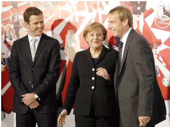
Bierhoff, Chancellor Merkel, Klinsmann (File Photo)